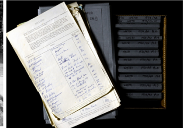
petition to introduce te reo Māori in schools, 1972, Archives Reference: ABGK 16127 W4731 date 15/2/1972-42